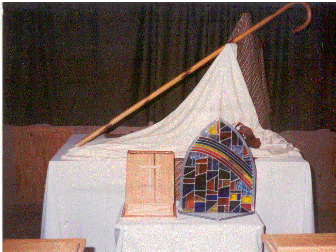
Thursday/Friday Night (10:00 pm) setup